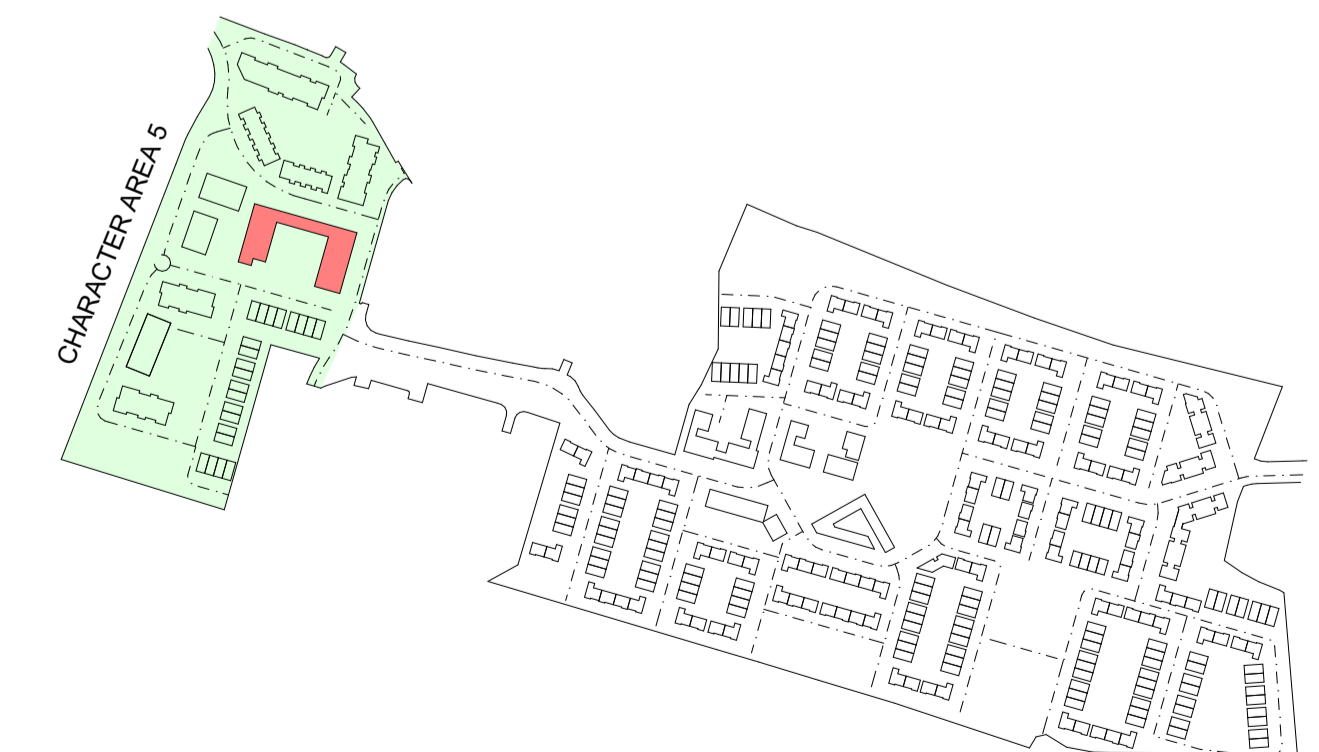
Keyplan (NOT TO SCALE)